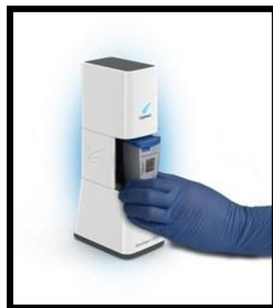
GeneXpert Omni Machine

Rapid molecular diagnosis, such as the new GeneXpert machine, is much more accurate than the microscope, but it is still greatly underutilized. Molecular diagnosis, which can also show whether the TB is drug resistant, must become the standard approach for all forms of TB, despite greater costs per test. A new, easier-to-take treatment for latent TB is also becoming available, and there is a new pediatric formulation to treat drug-sensitive TB.